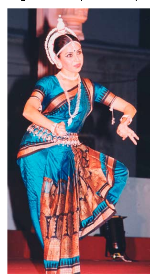
http://www.yoginigandhi.com/index. htm http://www.youtube.com/watch?v=I NaSqgA7lkQ