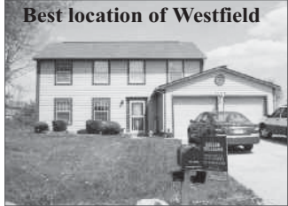
Best location of Westfield

Westfield farms $169,900 • 4 Bedrooms • 2.5 Bathrooms • 2344 Sq. Ft. on Main Floor • Lots of Improvements • Neat and Clean • Yard backs to Monon Trail