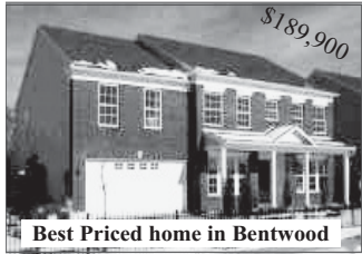
Best Priced home in Bentwood

Awesome in Avon $189,900 • 4 Bedroom • 2 1/2 Bath • 3532 Sq feet w 2 c garage • Neat and Clean • Beautiful Private backyard • Full Brick front