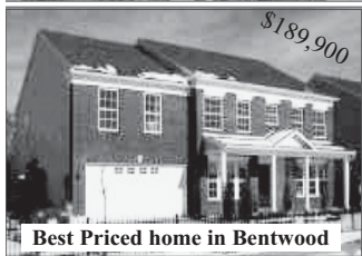
Best Priced home in Bentwood

Awesome in Avon $189,900 • 4 Bedroom • 2 1/2 Bath • 3532 Sq feet w 2 c garage • Neat and Clean • Beautiful Private backyard • Full Brick front