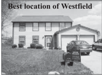
Best location of Westfield