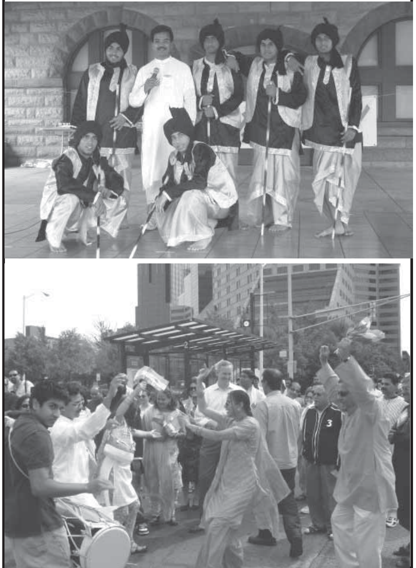
Glimpse of India Day

with a strong feeling that the concert may have kindled interest in vocal classical music in those who have had little exposure to it. The only disappointment, voiced by many in the audience, was that the concert was too short, just under two hours.